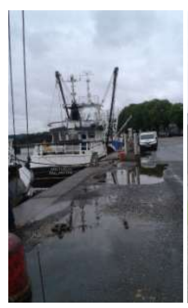
Stormy sky and fishing boat.