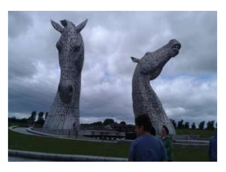
Just what it looks like. Horses. Huge metallic horses.