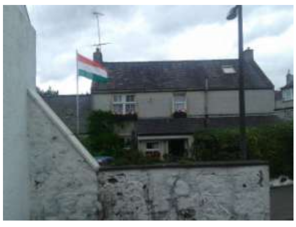
I made a lot of high-quality photos that day. I'm the proudest of this one by far.