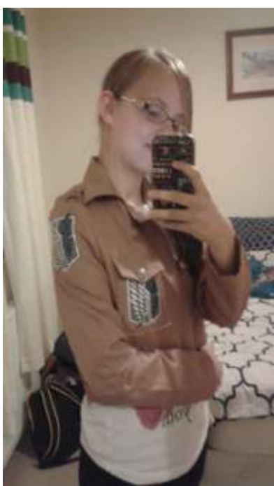
This is THE jacket if you were wondering. And that's me wearing it.